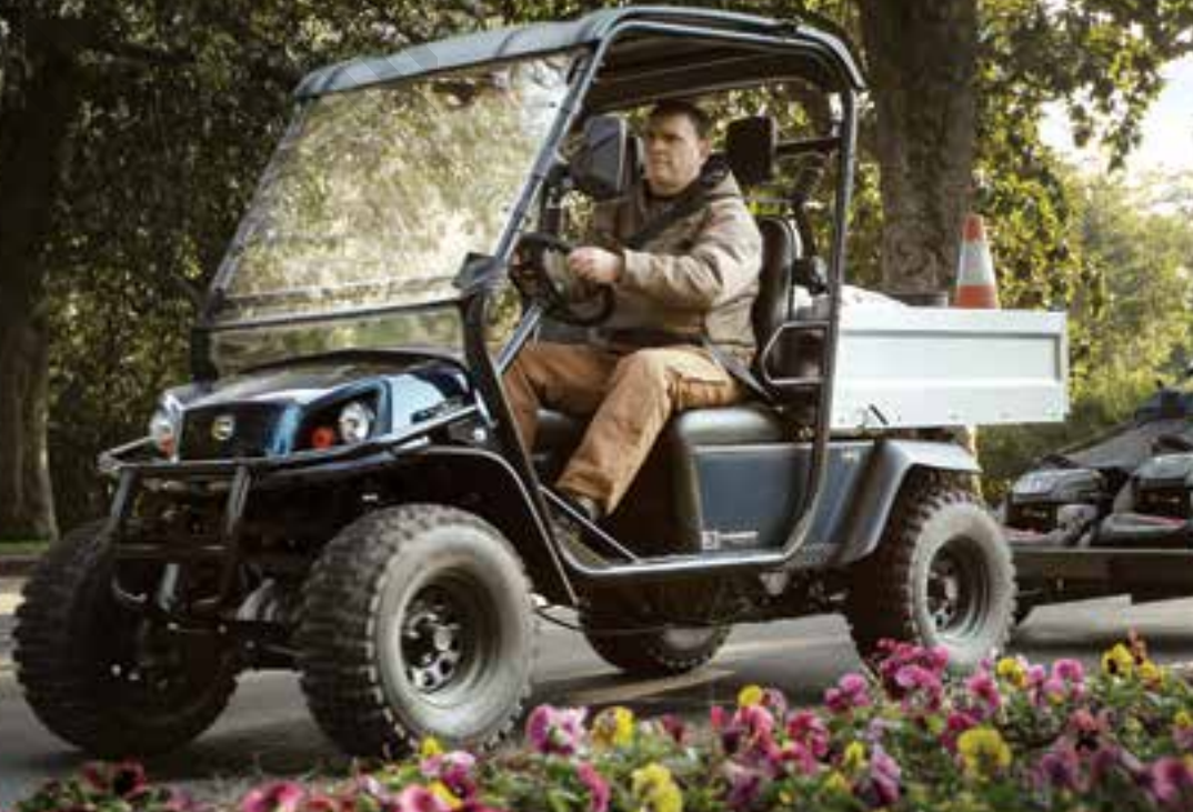
HAULER 4X4 GASOLINE