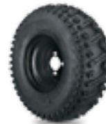
TURF SAVER TIRES – 20X10-10 WITH BLACK RIMS