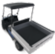
ALUMINUM BED KIT