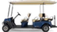
SHUTTLE 6 1,200-lb Capacity