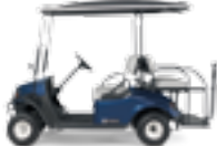
SHUTTLE 2+2 800-lb Capacity