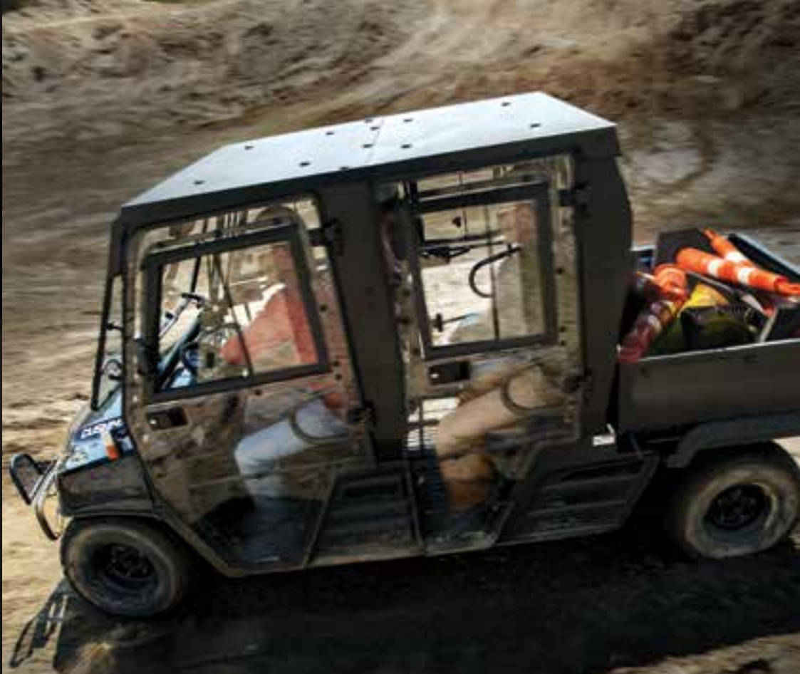
HAULER 4X4 CREW