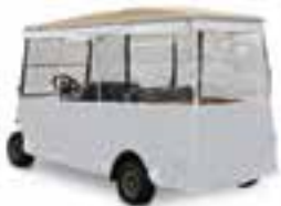
ENCLOSURE – WHITE