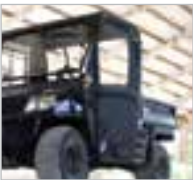
FRAMED VINYL W/DOORS Diesel Model Only