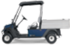
HAULER PRO 72-volt AC Drivetrain