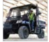
4X4 DIESEL CAB KIT Diesel Model Only