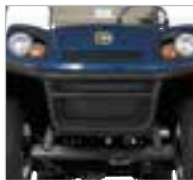
BRUSHGUARD – BLACK OR STAINLESS STEEL