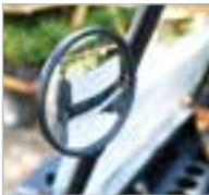
SIDE MIRROR KIT