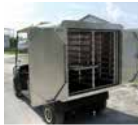
HAULER WITH FOOD BASKET