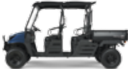
HAULER 4X4 CREW 22-hp Diesel Engine 1,325-lb Load Capacity