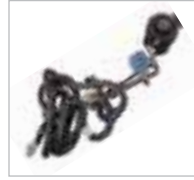
DIESEL KIT BUZZER, PARKING BRAKE, Diesel Model Only