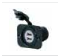
USB 12V SINGLE PORT