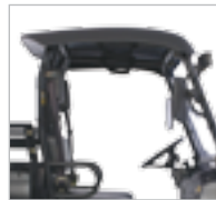
4X4 TOP CANOPY KIT Diesel Model Only