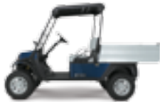
HAULER 1200X 13.5-hp Gas Engine