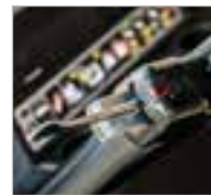
SIDE VIEW MIRROR KIT WITH LED TURN SIGNAL