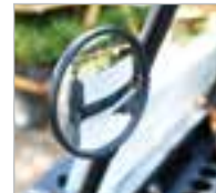
SIDE MIRROR KIT