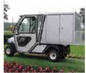
HAULER WITH VAN BOX AND BASKET