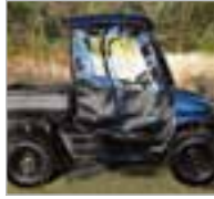
4X4 DIESEL ENCLOSURE KIT Diesel Model Only