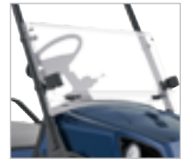
WINDSHIELD – SPLIT CLIP