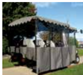
SHUTTLE TOUR WITH CURTAIN COVER