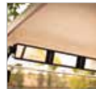
5-PANEL WIDE REAR MIRROR