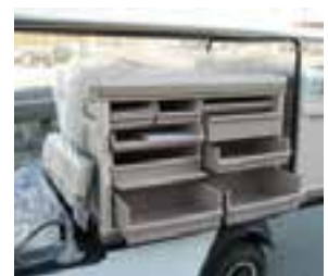
SHUTTLE WITH HOSPITALITY ROOM SERVICE BOX