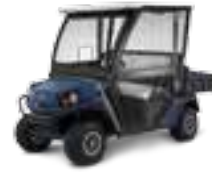
STEEL CAB ENCLOSURE WITHOUT DOORS