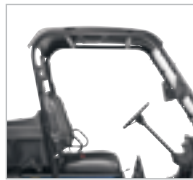
TOP CANOPY KIT Gasoline Model Only