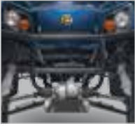
BUMPER - FRONT WELDMENT Gasoline Model Only