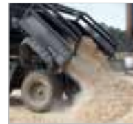
HYDRAULIC DUMP KIT Diesel Model Only