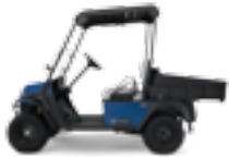
HAULER 800X 13.5-hp Gas Engine or 48-volt DC Drivetrain