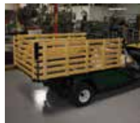
SHUTTLE WITH HAY RACK