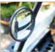
SIDE MIRROR KIT