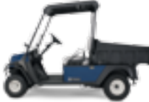
HAULER 1200 13.5-hp Gas Engine