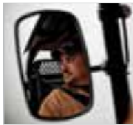
RR MIRROR KIT Diesel and Crew Models Only