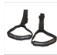
PAIR OF 360 GRAB HANDLES