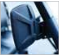
SIDE MIRROR KIT Gasoline Model Only