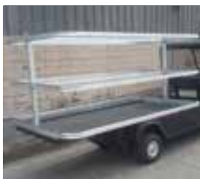
SHUTTLE WITH KAYAK RACK