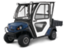
HARD CAB ENCLOSURE WITH DOORS