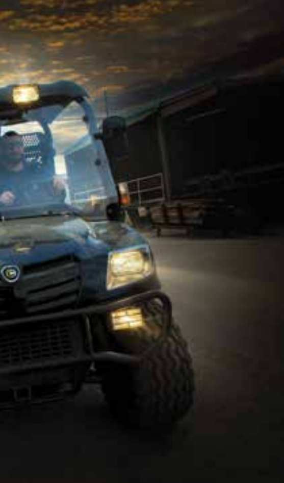
HAULER 4X4 DIESEL