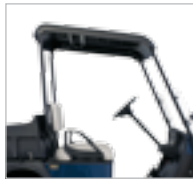
CANOPY TOP – 54"