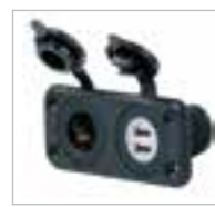
USB 12V DUAL PORT