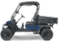
HAULER 4X4 28-hp Gas Engine 1,200-lb Load Capacity