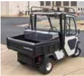
HAULER WITH TOOL BOX AND LADDER RACK