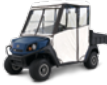
SOFT CAB ENCLOSURE – BLACK, GRAY, GREEN, TAN OR WHITE