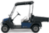
HAULER 800 13.5-hp Gas Engine or 48-volt DC Drivetrain