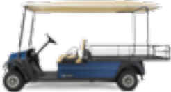
SHUTTLE 2 1,200-lb Capacity