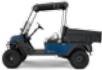
HAULER PRO-X 72-volt AC Drivetrain