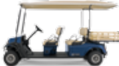
SHUTTLE 4 1,200-lb Capacity