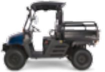
HAULER 4X4 DIESEL 22-hp Diesel Engine 1,600-lb Load Capacity