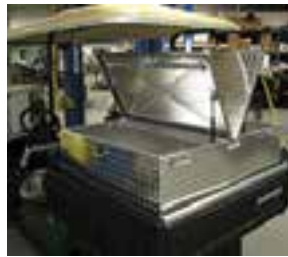
HAULER WITH DROP IN STORAGE BOX