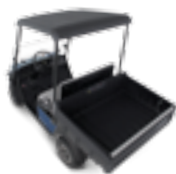
PLASTIC BED KIT – 36" OR 40"