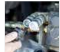
REMOTE HYDRAULIC KIT Diesel Model Only