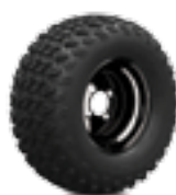
PF MTD BLACK STEEL – 22X11-10