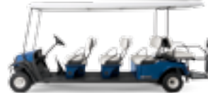
SHUTTLE 8 1,600-lb Capacity