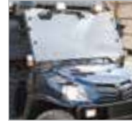
FLAT WINDSHIELD KIT Diesel and Crew Models Only